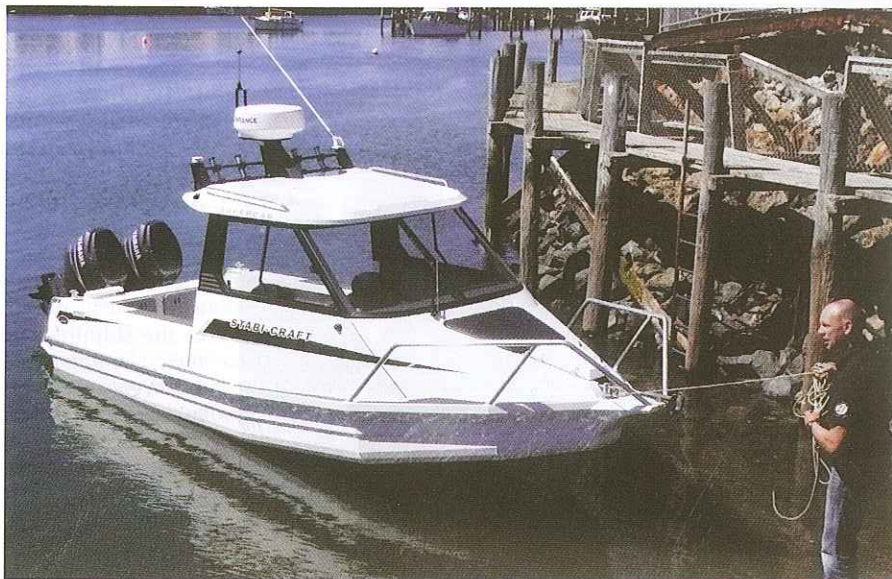
Stabicraft's Leon Johnston at the launch of one of the Australian Customs vessels

Mr Corrigan said the boats would be used in a variety of roles, mainly based around rivers and estuaries with limited offshore work. The Australian Customs and Border Protection Service's fleet included vessels up to 38 metres in